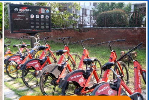
Enjoy smart biking in the city on safe cycle tracks. Anywhere in the smart city