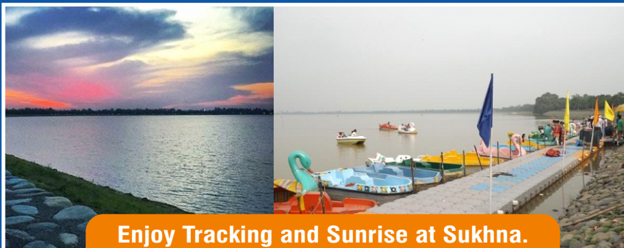
Enjoy Tracking and Sunrise at Sukhna. With boat ride and much more fun