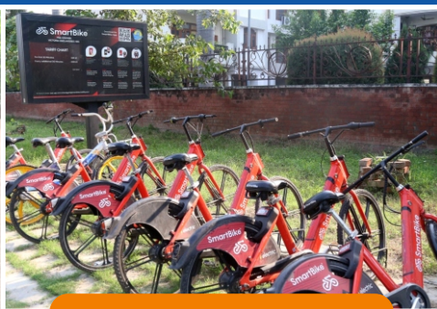
Enjoy smart biking in the city on safe cycle tracks. Anywhere in the smart city